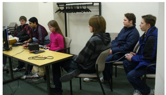
Local Teens participate in the DCL’s Teen Gaming Night on Friday, February 19, 2010.