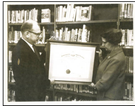
Presentation of Library Charter Just one of the many images now archived on CNYHeritage.