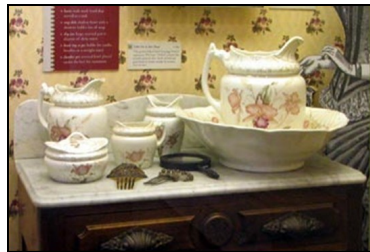
A display of Syracuse China as seen at the Onondaga Historical Association.

The Friends of the DeWitt Community Library will hold their Annual Meeting at the Library on Wednesday, January 19 at 7:00 pm . This brief meeting will be held in the DCL Friends Meeting Room prior to our guest speaker/entertainer.