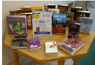
* Donation goes to support DCL programs and services.

We will be accepting donations of "gently used materials" in advance of our Blowout Sale after Saturday, October 1. Please call ahead at (315) 446-3578 for more information about donating items.