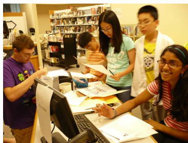
Investigating the crime at the Teen Murder Mystery Night held on Friday, August 12th.

Join us for next year's Summer Reading program "Own the Night."