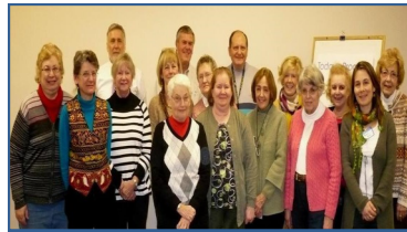
2013 Board of the Friend of the DeWitt Community Library